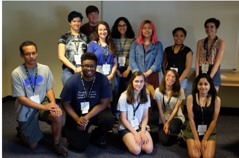
Welcome Class of 2021!